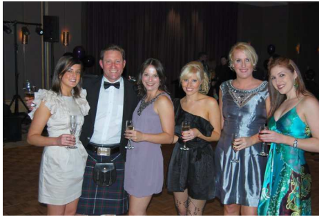
Can make a "man" think he is cool in a kilt.....until.....