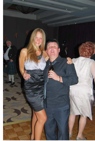
And makes other "men" think they are invincible!!!!