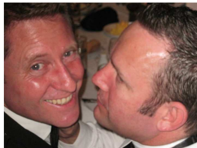
Then that "man" goes back to what he knows!