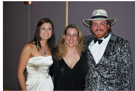
But some things just cannot be explained!!! Best tux EVER!!!!