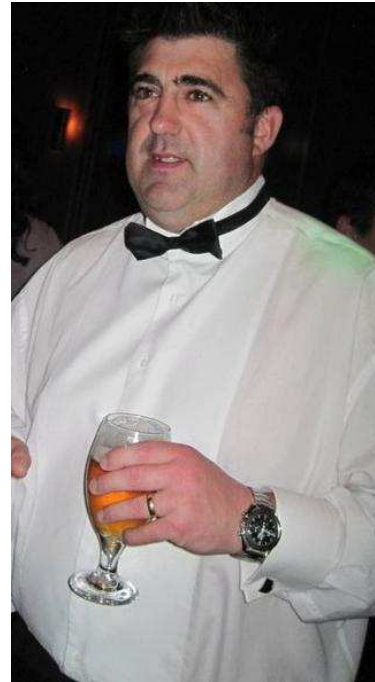
3 rd Grade Stalwart!