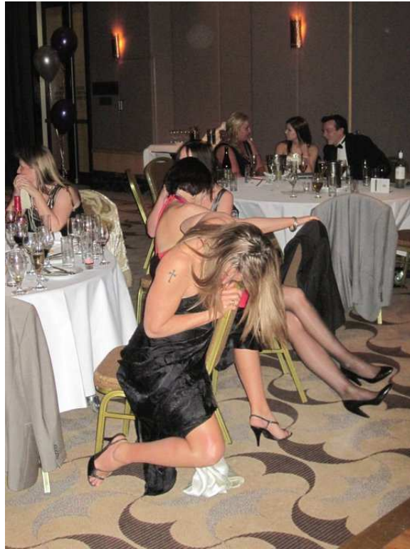
Others see the "real" truth!